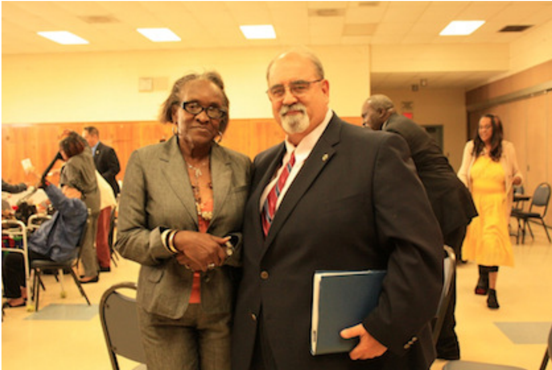
Womans Club of Hawthorne Candidates Forum