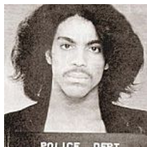
15 Horrible Crimes Committed by Famous Celebrities Buzzlie