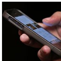
Teen shot to death after tracking down his stolen smartphone Fox News