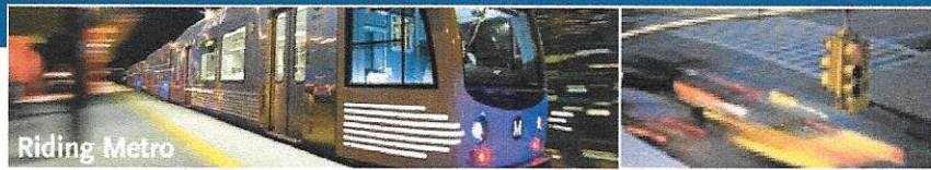
Photo Enforcement Services