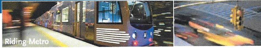
Photo Enforcement Services