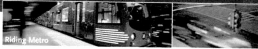
Photo Enforcement Services