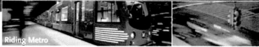
Photo Enforcement Services