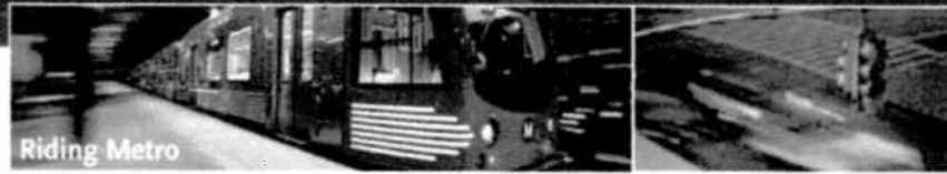
Photo Enforcement Services