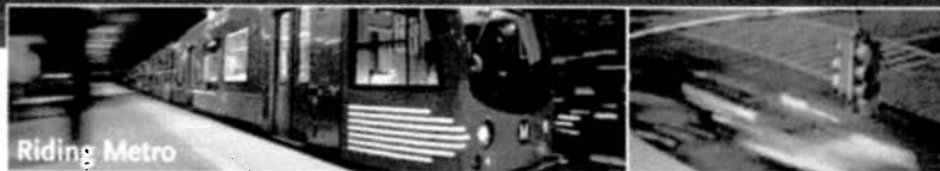
Photo Enforcement Services