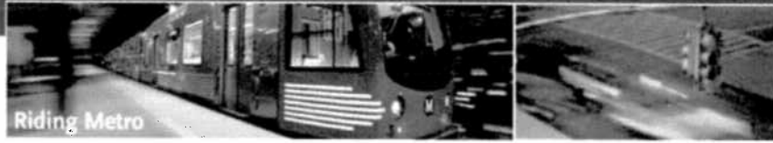
Photo Enforcement Services

LOS ANGELES COUNTY METROPOLITAN TRANSPORTATION AUTHORITY