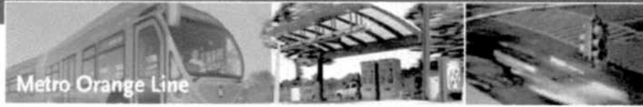
Photo Enforcement Services